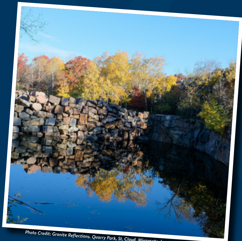
Photo Credit: Granite Reflections. Quarry Park, St. Cloud, Minnesota. Lawrence Cosslett